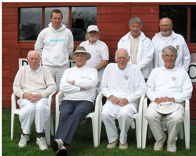
Extracted from our own club Newsletter - A SW Federation League AC match at Plymouth in May

We shall miss him here but our thoughts must be with his family for the loss they have suffered.