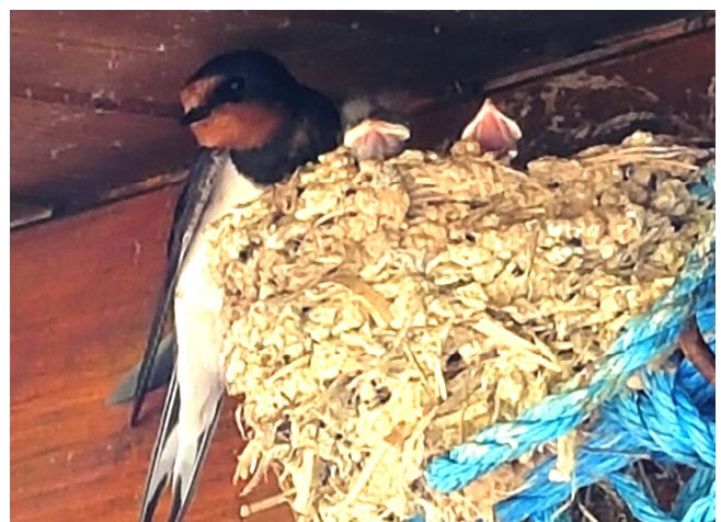
Happily our feathered friends managed to make the journey back to us this year.

Your attention is drawn to the club's Code of Good Practice - Safeguarding Childrency on the noticeboard above the bookcase. As we have more children visiting the club please read it and adhere to it. This exists for the benefit of us all.