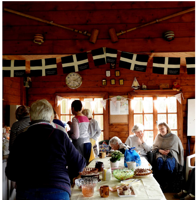
The 'Puds' revealed.

So, what's been going on since the last Newsletter? The winter indoor games sessions continued despite some very cold weather and, of course, that event which is rapidly becoming a permanent fixture in our club calendar - 'Pasty and Pud'. This was held in early March and provided a much appreciated opportunity for members to get together in that long hard winter.