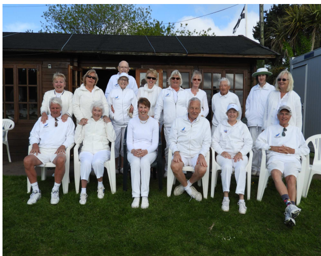
Members of Cornwall Croquet Club and East Dorset Croquet Club at the end of an enjoyable day.

At the beginning of the season we welcomed a team from East Dorset Croquet Club to a friendly match. This was a very informal affair which I am happy to say Cornwall won. A very enjoyable day and a good result. Some of the East Dorset members enjoyed their visit so much that they returned on one of the Open Afternoons to play.