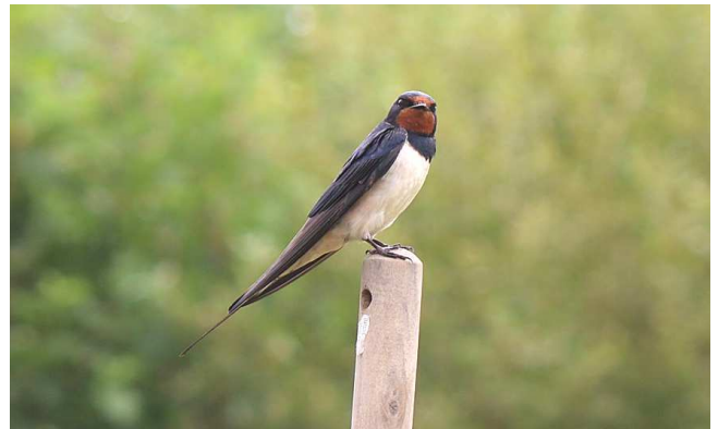
One of our newest members, June 2017. The pair successfully raised 3 chicks whilst with us. Perhaps they will return next year now they know we're