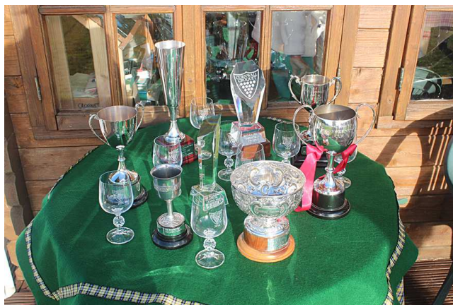
The cups and trophies on Finals Day, 2nd October 2016