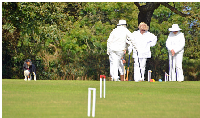
Local interest at St Agnes. This visitor was so absorbed in the game that he eventually had to be escorted off the premises.