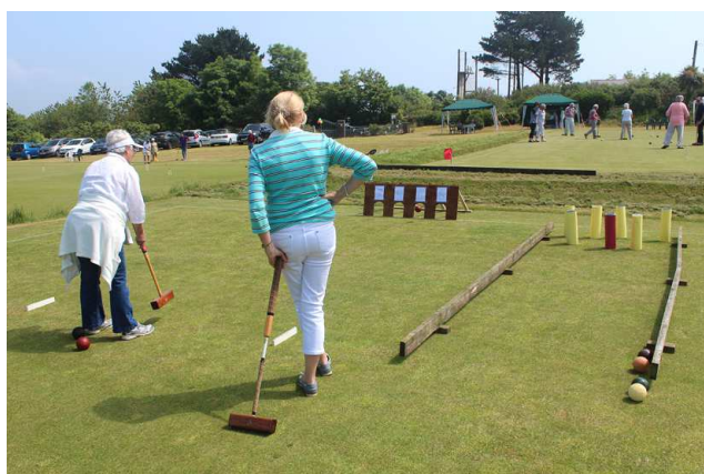
The extra games