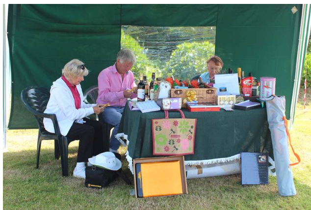
That wonderful raffle

And finally - some images from Open Day, thanks to Stephen Read.