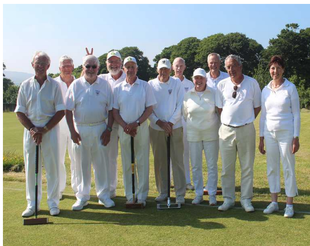
Golf Level Play teams, Cornwall v Sidmouth. There is a light-hearted side!

And finally - some images from Open Day, thanks to Stephen Read.