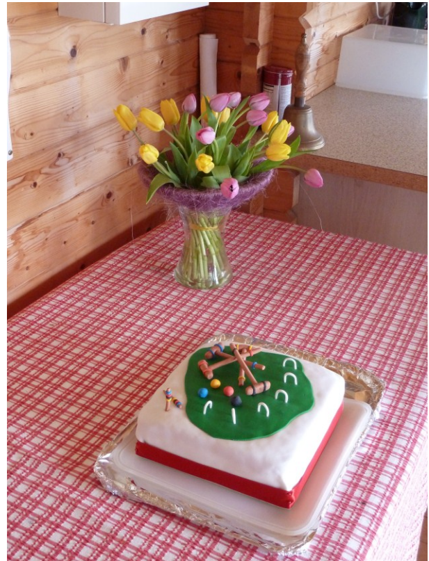
The magnificent croquet cake.

All in all, I think the Club rose magnificently to the occasion, and many kind comments were made. Very many thanks to all involved with the preparation & running of the event. As many of you will know, Radio Cornwall's interviews & chat may be accessed from the website, and the Sta. Austell Voice gave us generous coverage.