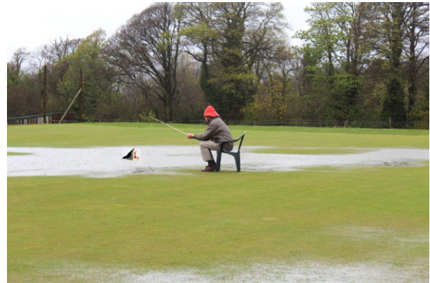
The Chairman hooks a dangerous catch on Lawn 1

Open Day This was held on April 29 th . A vile day had been confidently forecast, and was all too true. A northeast gale, driving rain, and temperatures which, according to my car, ranged from 4C to 7C. There was no way the event could be cancelled, as we didn't know whether any heroic visitors would turn up. I have never seen so much surface water on Lawn 1.