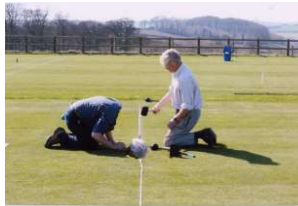
.....If only his aim was better

Lawns 1 & 2 have been vertidraind & surface dressed, and lawn 3 surface dressed only, on the advice of the Golf Club greenkeepers.