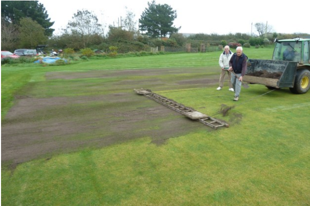
Ladder dragging on lawn 1

We were delighted and relieved that despite the very late notice of the work party, the usual “lawn gang” had much appreciated additional help – very many thanks to all involved.