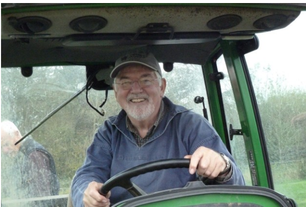
Our driver for today's outing was .....