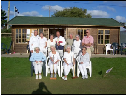
New Members' Day 2008 Group Photo..